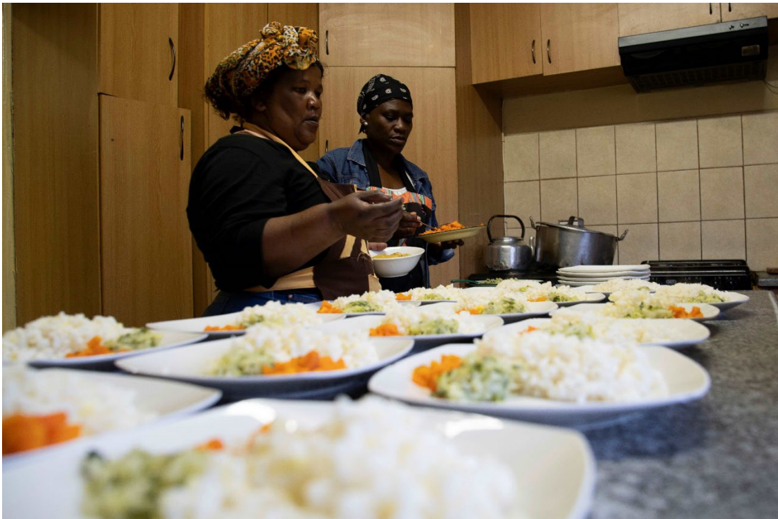
Employees of the Dimbaza Society for the Aged prepare lunch at its service center in Dimbaza, Eastern Cape.