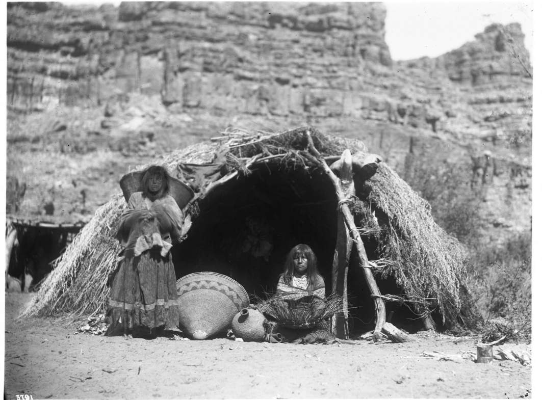
Two Havasupai Indian women in front of a native dwelling, Havasu Canyon, ca.1899